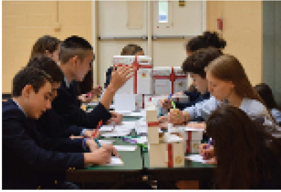
Students participate in the Box of Joy ministry, https://crosscatholic.org/boxofjoy , putting together 35 boxes filled with gifts for children in developing countries.