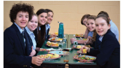
Students partake in a Martinmas feast - a traditional European feast hearkening back to medieval times, held on St. Martin's feast day. The feast traditionally offers an opportunity to give thanks for the harvest in anticipation of the upcoming Advent fast.