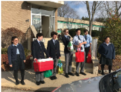
The student-initiated "Society of Mother Teresa" club organizes a turkey drive before Thanksgiving, supplying over 30 turkeys to needy families. The Society is dedicated to spiritual and corporal works of mercy.