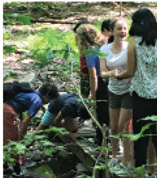
Students enjoy an informal hike.