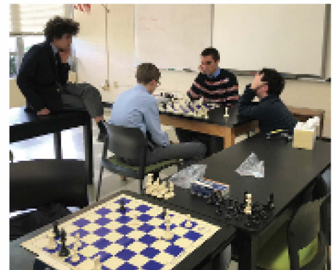
CKA students have initiated a chess club, which meets weekly for practice and strategy-building sessions. Competitive matches with other schools are on the calendar!

{This} is the great ordinary means to a great but ordinary end; it aims at raising the intellectual tone of society... It is the education which gives a man a clear conscious view of his own opinions and judgments, a truth in developing them, an eloquence in expressing them and a force in urging them." -St. John Henry Newman