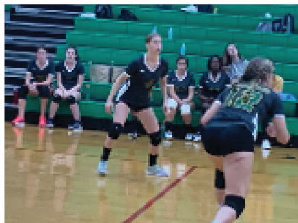
(Left, above) CKA students participating on Trinity Catholic sports teams.